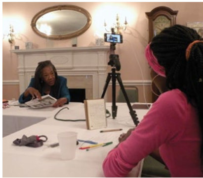
Top to bottom: Youth interview a Choctaw Nation historian for an exhibition in Poteau, OK, a student team from Lansdowne High School gathers stories from a business owner in Ellicott City, MD, and a youth story collector interviews a community member in St. Joseph, MI

Coming Home: Stories from Main Street is a project that invites young people to learn about their communities, document local history, and foster important discussions about their community's future by: