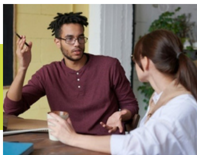
Spark Elevating Conversations