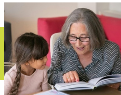
Celebrate Reading and Writing